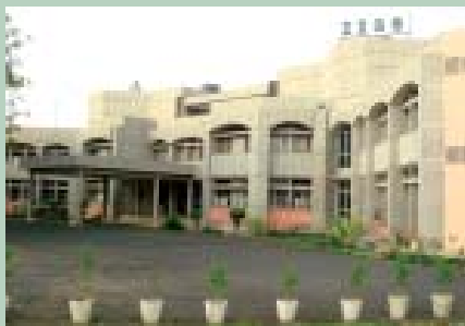
Venue of the Convention

at IISS, Bhopal, Madhya Pradesh 14-17 November 2010