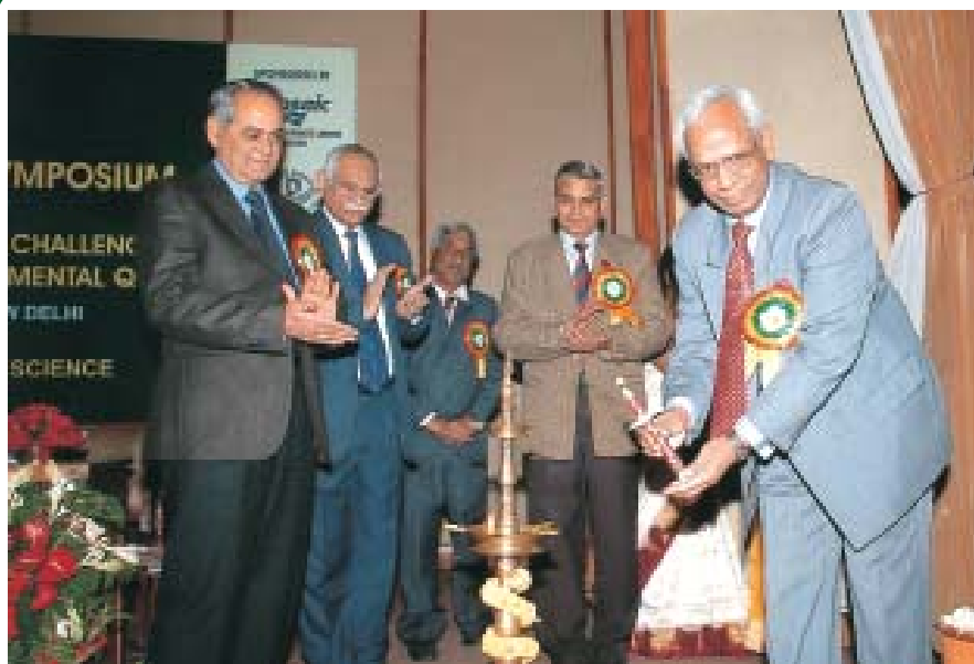
Lighting of the lamps by the Chief Guest