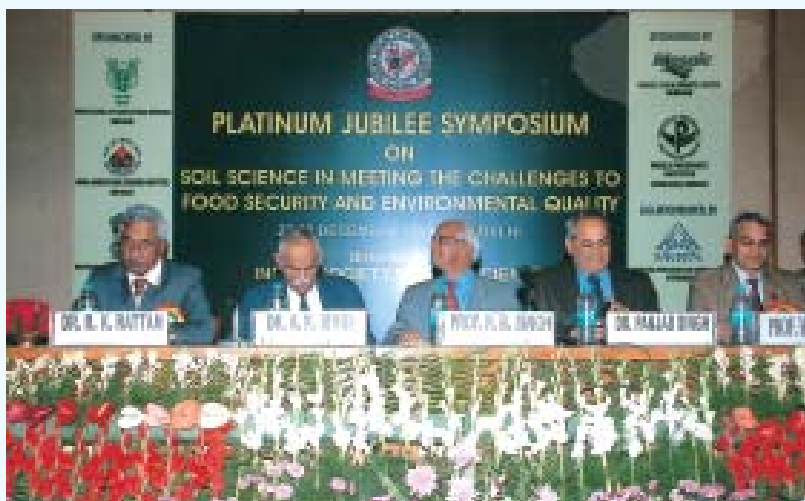
Dignitaries at the dais on Inaugural Function of the Platinum Jubilee Celebrations and 74th Annual Convention of ISSS