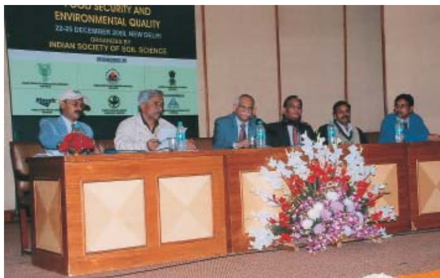
74th Annual General Body Meeting in progress

Grateful thanks are expressed to all these organizations.